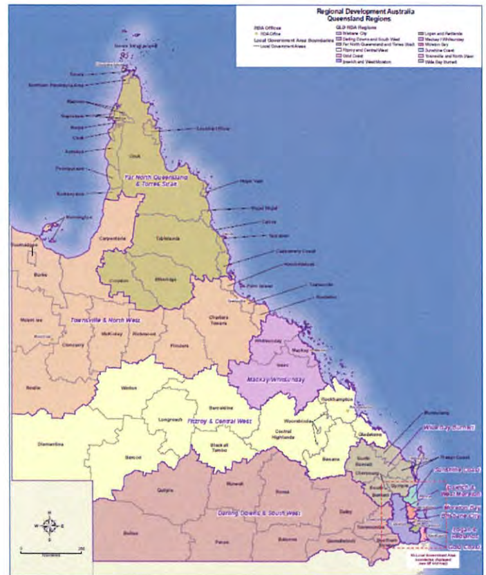
Queensland Regional Development Australia Committees

There are 52 regional development committees in Australia, 12 of which are in Queensland.