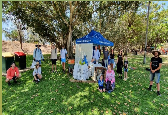
Beach clean-up at Alva Beach October 2020

In 2020 and 2021, Council has supported community and industry groups working to improve Reef health by participating in two beach clean-up events which took place at Alva. The first clean-up, which was organised by Tangaroa Blue, removed 294kg of rubbish from the beach and coastal area. The second clean-up which was part of the NAIDOC week celebrations and organised by the Gudjuda Reference Group Aboriginal Corporation, resulted in the removal of 230kg of rubbish from the beach and dune areas. Council assisted in debris data collection and waste disposal. The efforts made by staff and volunteers to conduct these clean-ups means less rubbish on the coastal area and less impact on the Great Barrier Reef ecosystem.