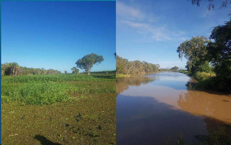
Red Lily Lagoon (before and after weed removal)

In the 2019/2020 financial year, Council signed the Riparian Management Agreement (RMA) framework document with Lower Burdekin Water and NQ Dry Tropics. The Vision in the framework is: Stakeholders in the Burdekin working together to restore and enhance the environmental, economic and recreational value of lagoons and waterways, and in turn improving the quality of the water that enters into the Great Barrier Reef catchment.