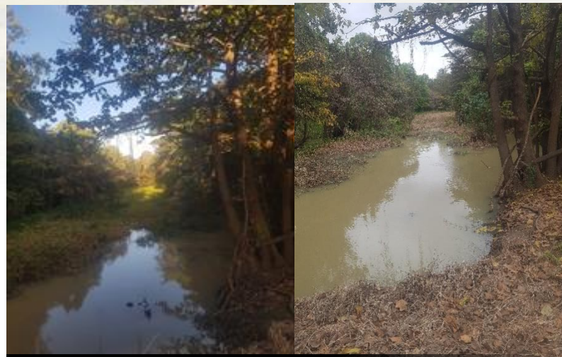
Drone spraying used in area inaccessible by boat or helicopter

Aquatic weed removal through the Riparian Management Program have contributed to Reef health by reducing the organic content flowing out to reef, improving the water quality and maintaining the fish habitats.