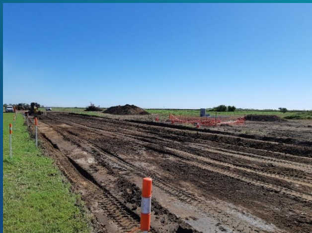
Site visit to conduct REF for Council work

Council has the objective to reduce the negative impacts on the environment from its capital and operational work programs. In 2020, relevant Council staff have received training over two days on erosion and sediment control aimed to increase staff knowledge and skills in managing erosion and sediment run-offs from Council work sites.