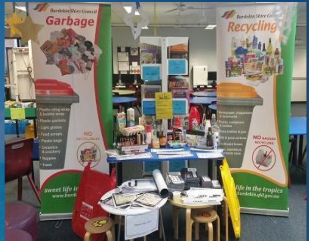
Burdekin school talk

Burdekin Shire Council also provides presentations to Burdekin schools and community groups to educate about the importance of recycling and waste management, including talks about DIY composting and worm tubes. Resources about waste and recycling are also provided in the forms of booklets, fact sheets, stickers, and magnets.